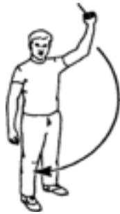
Figure. No caption available.

1B. Diagonal Pattern D2 Flexion: Gripping tubing handle in hand of involved arm, begin with arm out from side 45° and palm facing backward. After turning palm forward, proceed to flex elbow and bring arm up and over involved shoulder. Turn palm down and reverse to take arm to starting position. Exercise should be performed _____ sets of _____ repetitions _____ daily.