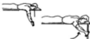
Figure. No caption available.

6C. Prone Rowing: Lying on your stomach with your involved arm hanging over the side of the table, dumbbell in hand and elbow straight. Slowly raise arm, bending elbow, and bring dumbbell as high as possible. Hold at the top for 2 seconds, then slowly lower. Perform _____ sets of _____ repetitions _____ times daily.