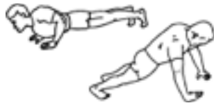
Figure. No caption available.

9A. Elbow Flexion: Standing with arm against side and palm facing inward, bend elbow upward turning palm up as you progress. Hold 2 seconds and lower slowly. Perform _____ sets of _____ repetitions _____ times daily.