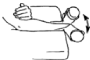
Figure. No caption available.

10C. Supination: Forearm supported on table with wrist in neutral position. Using a weight or hammer, roll wrist taking palm up. Hold for a 2 count and return to starting position. Perform _____ sets of _____ repetitions _____ times daily.