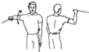
Figure. No caption available.

2D. (Optional) Internal Rotation at 90° Abduction: Stand with shoulder abducted to 90°, externally rotated 90° and elbow bent to 90°. Keeping shoulder abducted, rotate shoulder forward, keeping elbow bent at 90°. Return tubing and hand to start position.