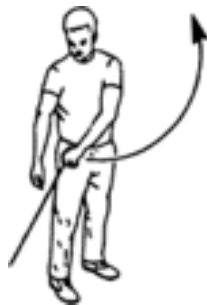
Figure. No caption available.

2A. External Rotation at 0° Abduction: Stand with involved elbow fixed at side, elbow at 90° and involved arm across front of body. Grip tubing handle while the other end of tubing is fixed. Pull out arm, keeping elbow at side. Return tubing slowly and controlled. Perform _____ sets of _____ repetitions _____ times daily.