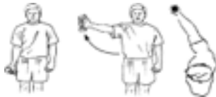
Figure. No caption available.

5. Sidelying External Rotation: Lie on uninvolved side, with involved arm at side of body and elbow bent to 90°. Keeping the elbow of involved arm fixed to side, raise arm. Hold seconds and lower slowly. Perform _____ sets of _____ repetitions _____ times daily.