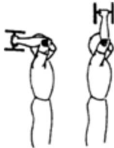
Figure. No caption available.

10A. Wrist Extension: Supporting the forearm and with palm facing downward, raise weight in hand as far as possible. Hold 2 seconds and lower slowly. Perform _____ sets of _____ repetitions _____ times daily.