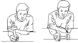
Figure. No caption available.