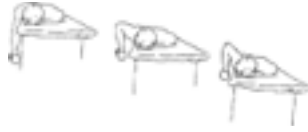
Figure. No caption available.

6D. Prone Rowing into External Rotation: Lying on your stomach with your involved arm hanging over the side of the table, dumbbell in hand and elbow straight. Slowly raise arm, bending elbow, up to the level of the table. Pause one second. Then rotate shoulder upward until dumbbell is even with the table, keeping elbow at 90°. Hold at the top for 2 seconds, then slowly lower taking 2-3 seconds. Perform _____ sets of _____ repetitions _____ times daily.