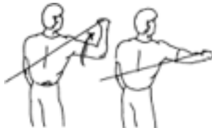
Figure. No caption available.

3. Shoulder Abduction to 90°: Stand with arm at side, elbow straight, and palm against side. Raise arm to the side, palm down, until arm reaches 90° (shoulder level). Perform _____ sets of _____ repetitions _____ times daily.