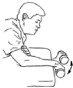
Figure. No caption available.

10B. Wrist Flexion: Supporting the forearm and with palm facing upward, lower a weight in hand as far as possible and then curl it up as high as possible. Hold for 2 seconds and lower slowly.