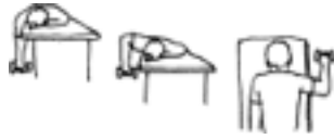
Figure. No caption available.

7. Press-ups: Seated on a chair or table, place both hands firmly on the sides of the chair or table, palm down and fingers pointed outward. Hands should be placed equal with shoulders. Slowly push downward through the hands to elevate your body. Hold the elevated position for 2 seconds and lower body slowly. Perform _____ sets of _____ repetitions _____ times daily.