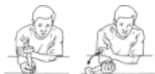
Figure. No caption available.