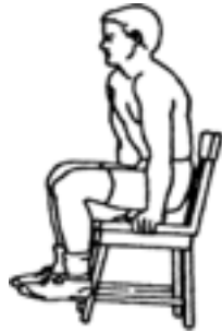
Figure. No caption available.

8. Push-ups: Start in the down position with arms in a comfortable position. Place hands no more than shoulder width apart. Push up as high as possible, rolling shoulders forward after elbows are straight. Start with a push-up into wall. Gradually progress to tabletop and eventually to floor as tolerable. Perform _____ sets of _____ repetitions _____ times daily.