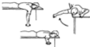
Figure. No caption available.

6B. Prone Horizontal Abduction (Full ER, 100° ABD): Lie on table face down, with involved arm hanging straight to the floor, and thumb rotated up (hitchhiker). Raise arm out to the side with arm slightly in front of shoulder, parallel to the floor. Hold 2 seconds and lower slowly. Perform _____ sets of _____ repetitions _____ times daily.